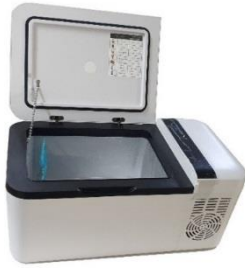
VC PF-12DC / 35-DC