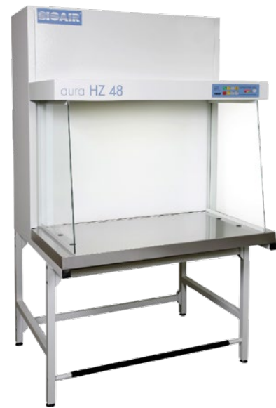
⊕ Lateral Flow Concept side walls