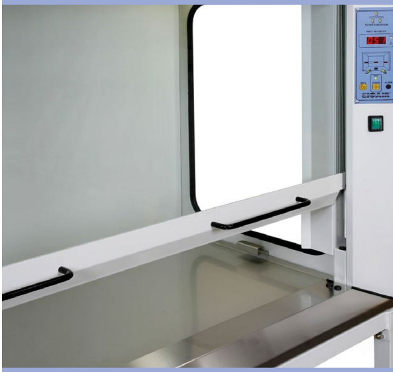
Safehood 120 detail