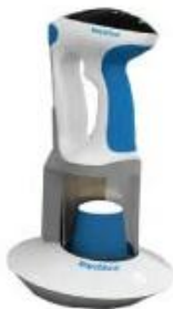
Automatic Injection System

High Level Disinfectant Solution. Sterilizing more than 99.9% of all germs and virus in 30 sec.