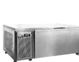
VF 86H-400 / 500